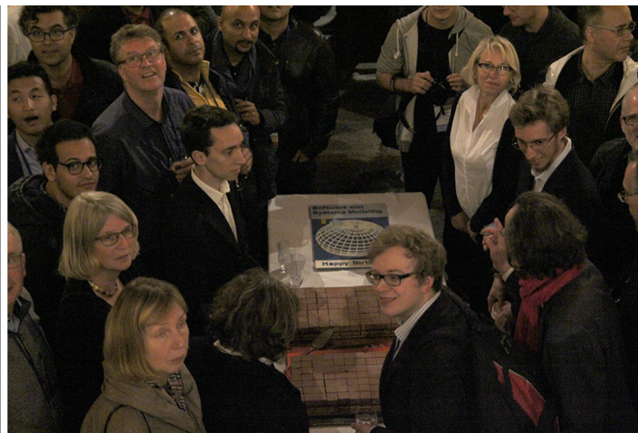
Photos of the 15th Anniversary Celebration at MODELS 2016